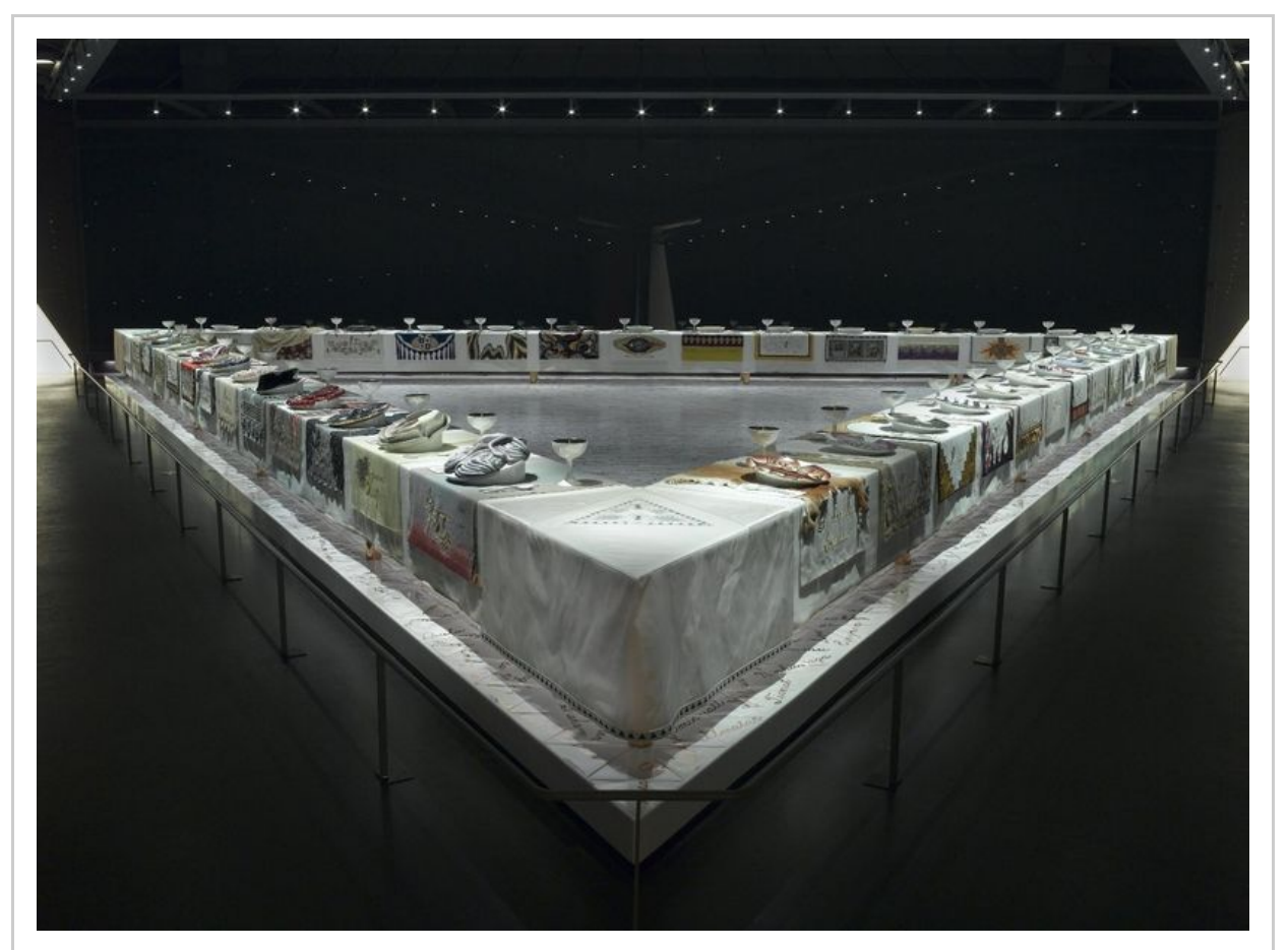
Judy Chicago – The Dinner Party, 1974–79. Ceramic, porcelain, textile, 576 × 576 in. (1463 × 1463 cm). Brooklyn Museum, Gift of the Elizabeth A. Sackler Foundation, 2002.10. © Judy Chicago.

1,083 women featured therein. That database needs to be expanded, renewed; more lectures on the work and its legacy held, especially given the installation is meant to be on view permanently.