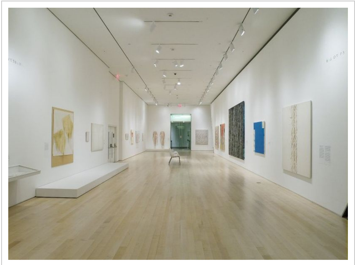
Installation view of Ghada Amer: Love Has No End at the Brooklyn Museum, curated by Maura Reilly